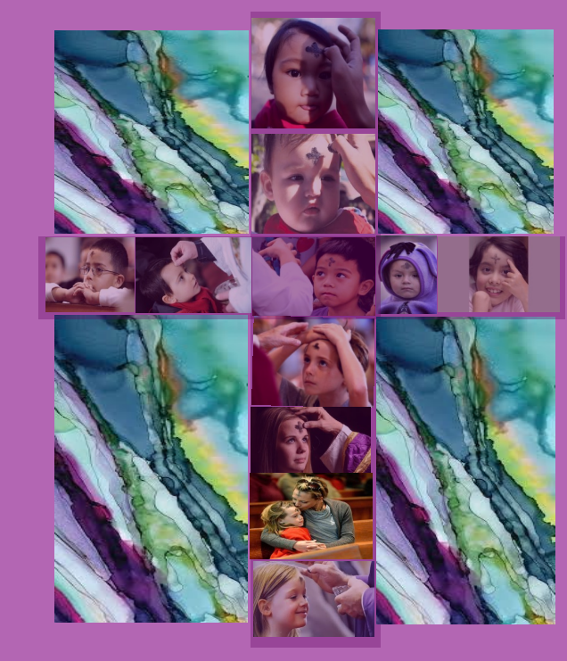
Safe Environment Newsletter February 2018

A few weeks back MSP offered a day long seminar on safety in Worship Spaces. An invitation was sent to all Business Office Administrators as well, inviting them to attend. There is now a no cost seminar that is being offered and will be held in two locations, Hastings and the Detroit area. It appears this seminar gives practical advice for churches and many safety and medical related training. This is not mandatory for your parish just an invitation if interested. A best practice is to contact your local law enforcement and invite them to your parish and spend time talking about the physical surrounding and how you can improve any areas of concern. A good start is to keep a binder of emergency numbers as well as hospital numbers on and off site and easily accessible. Please include your pastor in the initial conversation so he can partner in areas where time allows.