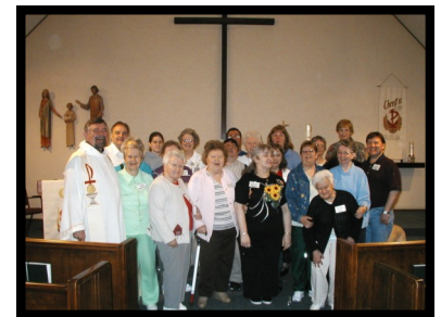
St. Francis Retreat

Wednesday PM. If you are interested in volunteering or attending any of these retreats please give our office a call. 517-342-2497