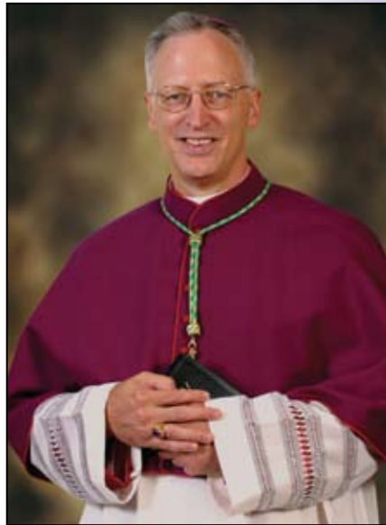
Bishop Earl Boyea Diocese of Lansing